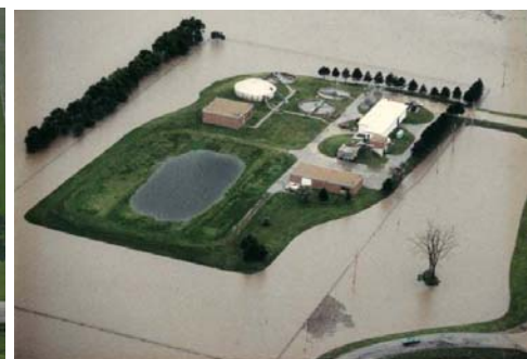
Figure 1: Falls City WWTP

WWTP during flood conditions (photo taken prior to 1995 construction)