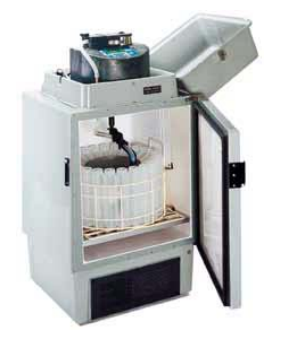
"Your Source for Samplers!"