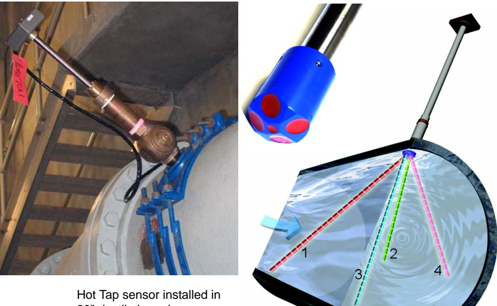
30" ductile iron pipe

Hot Tap's sensor tip emits four velocity beams (Figure 1), two pointing upstream and two pointing downstream. Each beam is made up of multiple, distinct cells pinged hundreds of times per minute, yielding thousands of velocity data points throughout the water column.