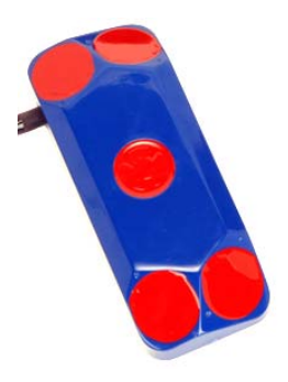
Ultrasonic level sensing ceramic pointing straight up, and four velocity sensing ceramics pointing in different directions