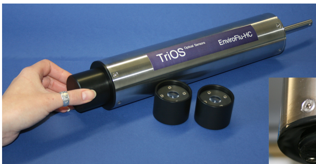
enviroFlu-HC with SolidCAL-HC solid secondary standard